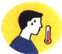
FEVER 100.4* *or school board policy if threshold is lower