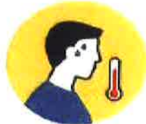
FEVER 100.4* *or school board policy if threshold is lower