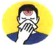
CONGESTION OR RUNNY NOSE