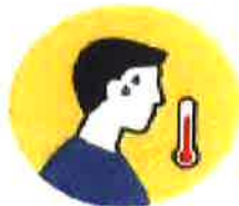
FEVER 100.4* *or school board policy if threshold is lower