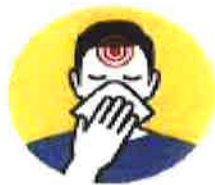
CONGESTION OR RUNNY NOSE